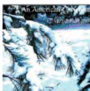
An American Christmas (2006)