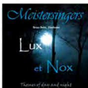
Lux et Nox (2012)