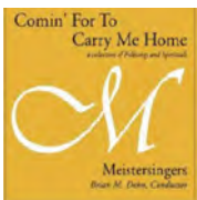
Comin' For To Carry Me Home (2003)