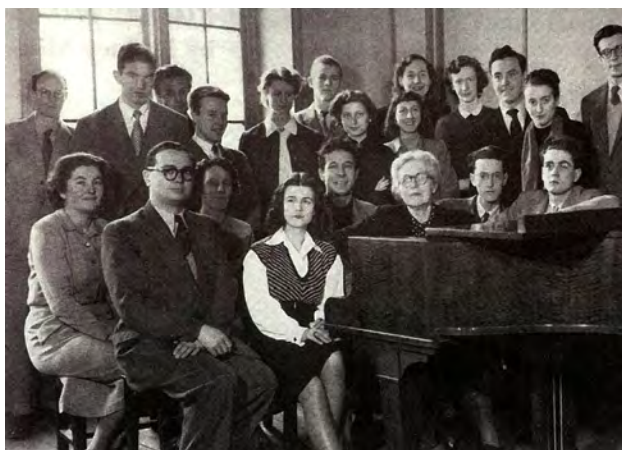
1953 Nadia Boulanger Class at the Paris Conservatory.

Virgil Thomson's (1896-1989) "Seven Choruses from the Medea of Euripides" transports listeners to ancient Greece, capturing the dramatic inten-