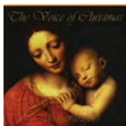
The Voice of Christmas (2004)