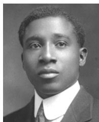
R. Nathaniel Dett

ing, her studio was also a gathering place for tea and social connection among the musical celebrities of the day, including Stravinsky, Poulenc, and Milhaud, as well as a veritable Who's Who list of playwrights, poets and painters flourishing in Paris in the decades leading up to WWII.