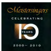
Meistersingers Celebrating 10 Years (2010)