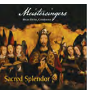
Sacred Splendor (2019)